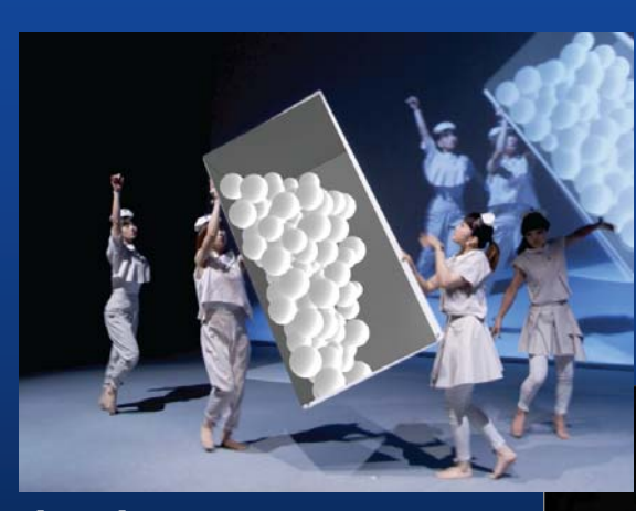
ElevenPlay - January 2018