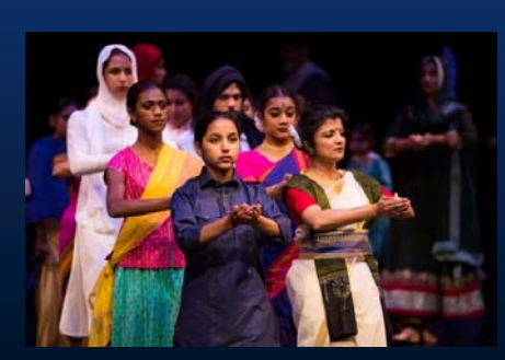
The Parting - M arch 2018