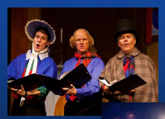
Reduced Shakespeare Co. December 2018

M usic, dance and theatrical events related to the holiday season