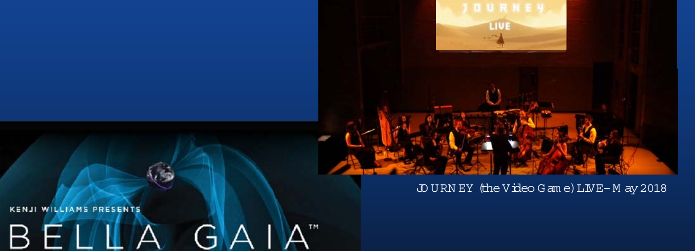
Bella Gaia - May 2018