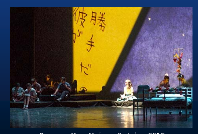
Peace on YourWings-0 ctober 2017