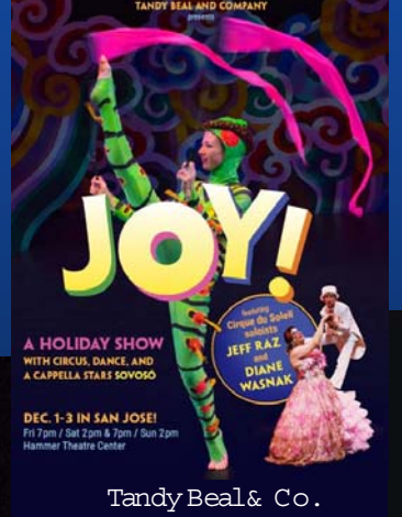
December 2017 & 2018