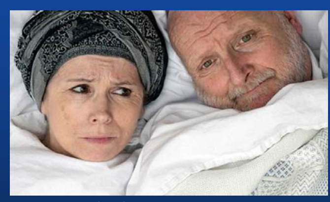
Shakespeare, His Wife & the Dog - February 2018

Live theatre, dance and off-Broadway theatrical productions. Also includes National Theatre Live screenings and other films