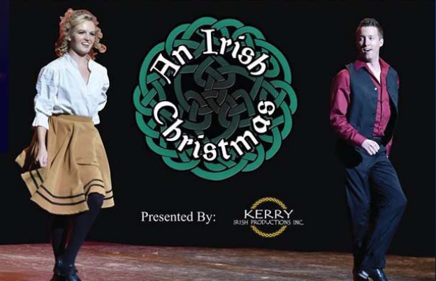
An Irish Christmas - December 2018