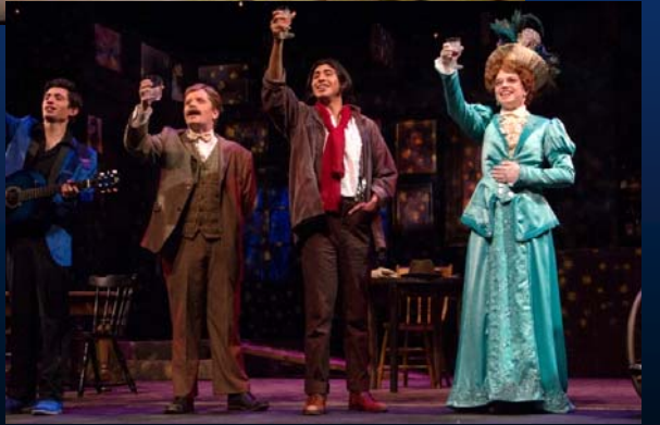
Pirasso at the Lapin Agile N ovem ber 2017