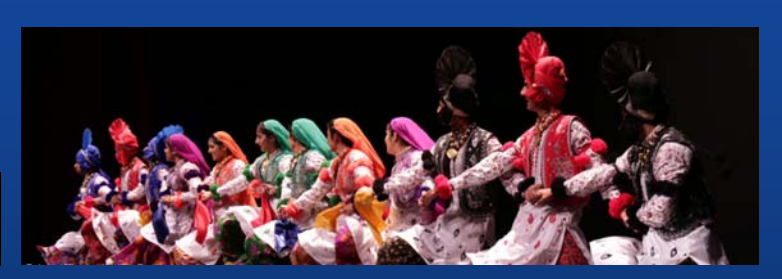
Legacy of Bhangra - September 2017

Black Legend Awards February 2017 & 2018