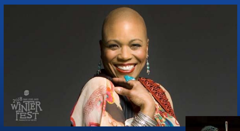
Dee Dee Bridgewaterw/SJSU Jazz Orchestra February 2018

M usic from around the world, including jazz, blues, reggae, latino, country & world music