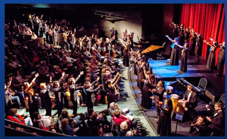
Kaleidosope! - O ctober 2017