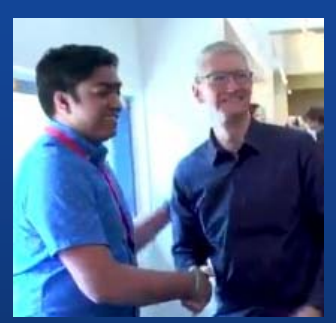
Apple Student Schokr Event June 2017