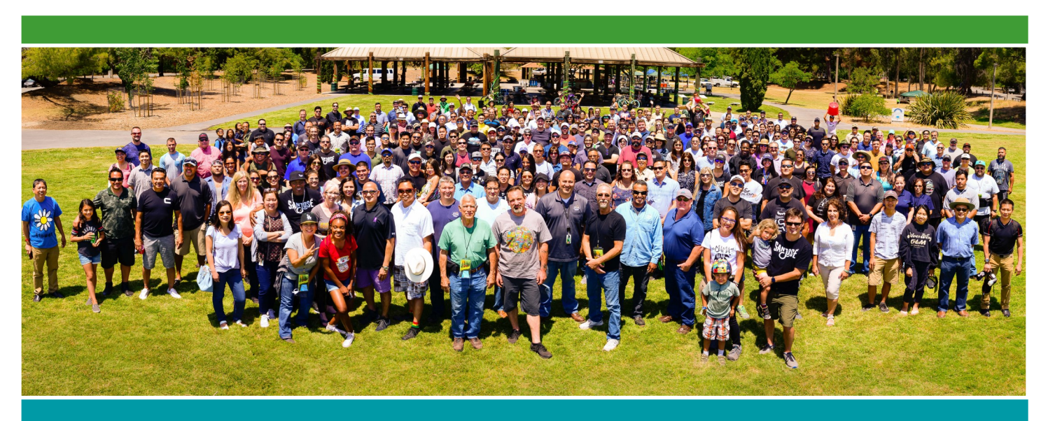
For more information on employee benefits, visit the City's benefits website: https://www.sanjoseca.gov/your-government/departments/human-resources/benefits

City of San Jose is an equal opportunity employer.