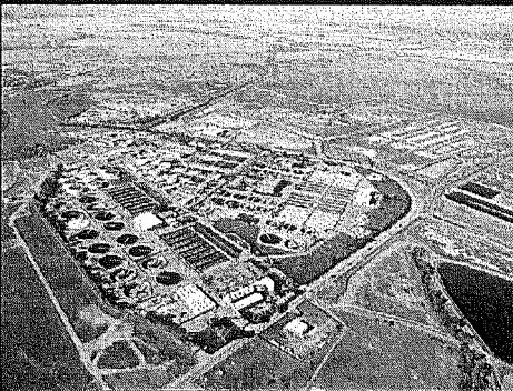
Water Pollution Control Plant