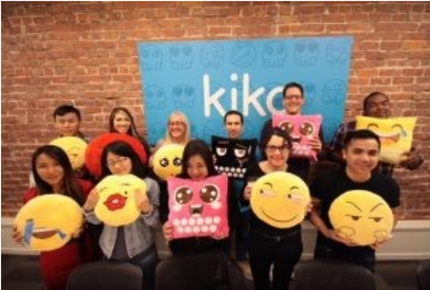
The Kika Tech team and emoji pillows in their downtown HQ..

Read the OED blogpost for details on the company and its explosive growth in the U.S.