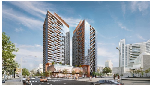
MIRO rendering, corner of E. Santa Clara and 4th Streets.

The buildings, totaling 1 million sf of new construction, will include a mix of one-, two- and three-bedroom units, including 16 penthouses and amenities, like a rooftop pool, fitness, spa and pet facilities and concierge services.