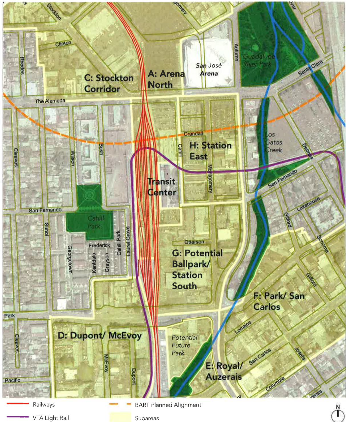
FIGURE I-2-2: DIRIDON STATION AREA