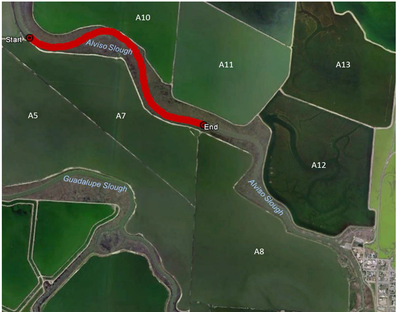
Figure 4: Another view of the section of Alviso Slough monitored for avian botulism through vehicle surveys, June-November 2020. Driving survey start/endpoint is dependent on levee drivability.