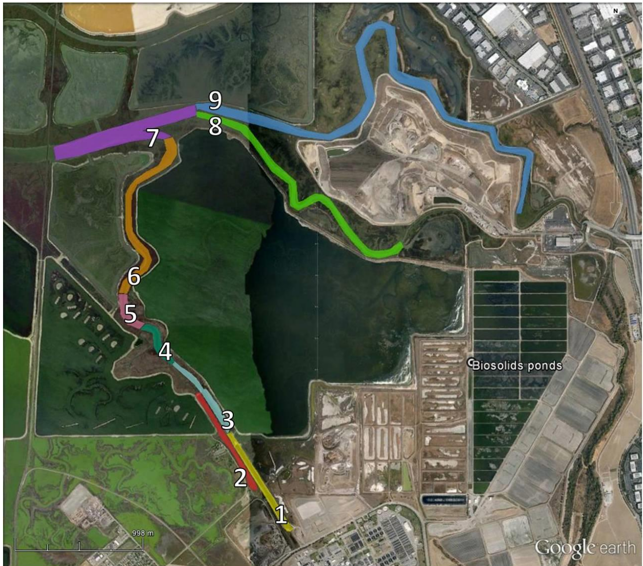
Figure 2. Another view of the survey sections along Artesian Slough (1-6) and Coyote Creek (7-9) monitored for avian botulism for the SJ-SC RWF, June-November 2020. Also indicated are the SJ-SC RWF biosolids lagoons/ponds.