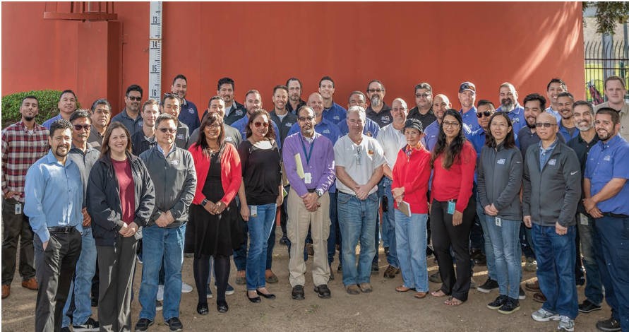
San José Municipal Water System staff in a photo taken prior to the start of the COVID-19 pandemic.

For water-efficiency tips or to view the complete list of water use rules in effect at all times, please visit www.sjenvironment.org/waterefficiency .