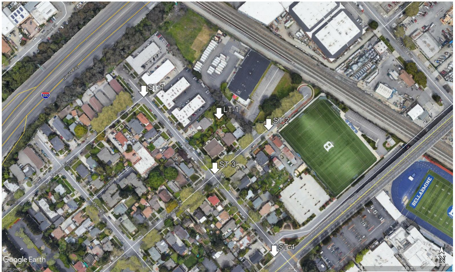
FIGURE 2: PROJECT VICINITY AND AMBIENT NOISE MONITORING SITES