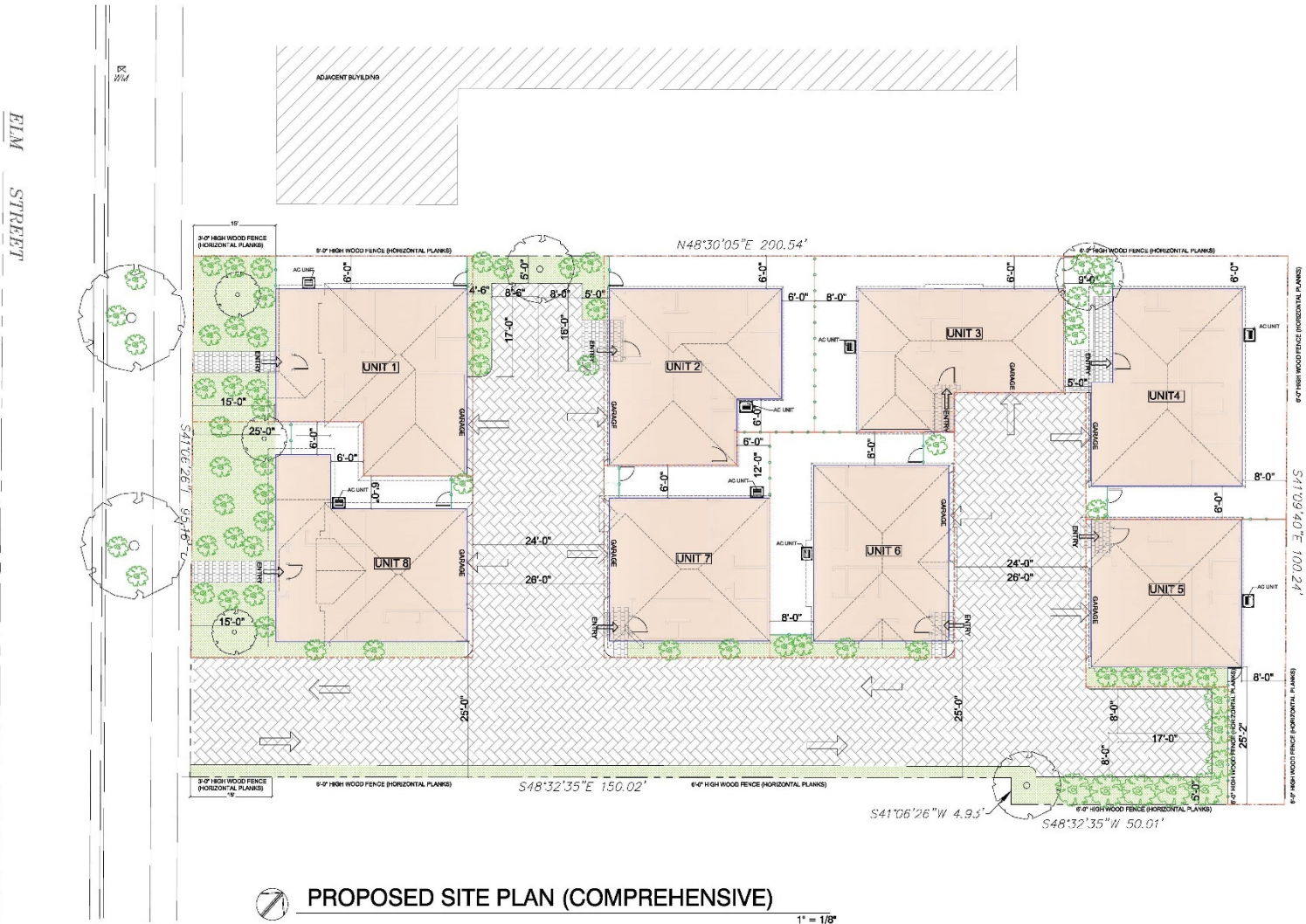
FIGURE 1: PROJECT SITE PLAN

FAHEH HABAYEB PLANNING & DESIGN 888 STOCKTON AVE. SAN JOSE, CA 95128 TEL: (408) 433-8332 E-MAIL: fhbayeb3@gmail.com