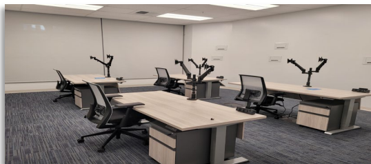
Coming Soon - The City's new Remote Parking Control & Customer Service Center located at the 4 th /San Fernando Parking Garage