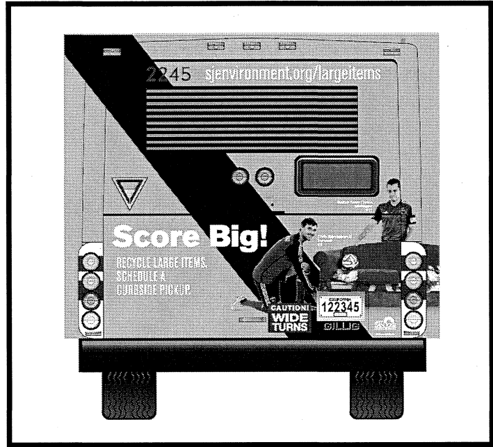
VTA Bus Advertisement