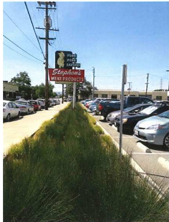
Public Project # PP07-278 - Stephen's Meats Parking Lot