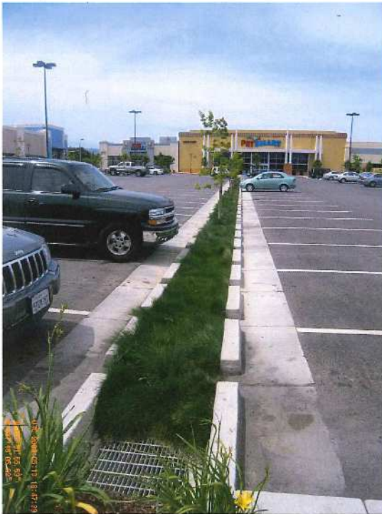
PDA05-058-01 - The Plant Shopping Center