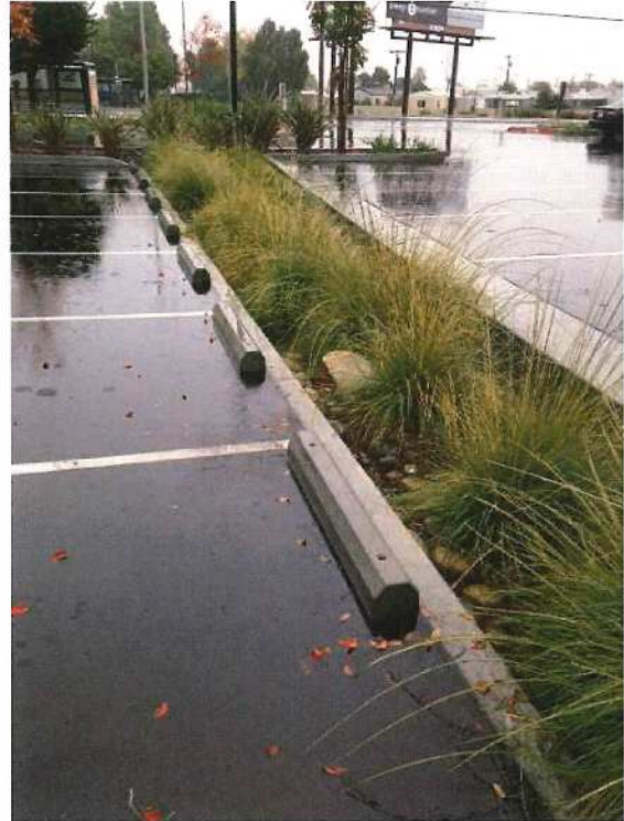
CP08-023 - Monterey Retail (Grocery Outlet/Chic Filet)