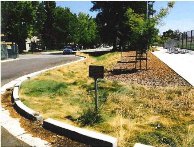
CIP 6406 - Misc Park