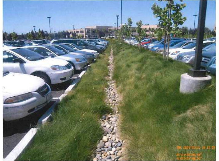
H05-053 - Cadence Seely Campus (Building 10)