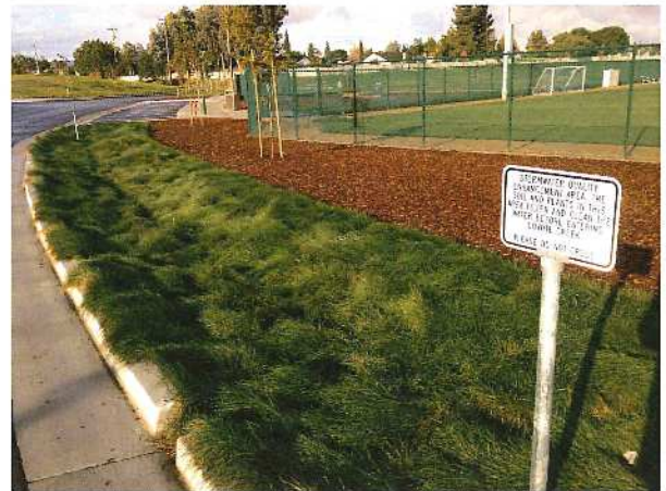
CIP 4949 - Watson Remediation and Ph. I Improvements