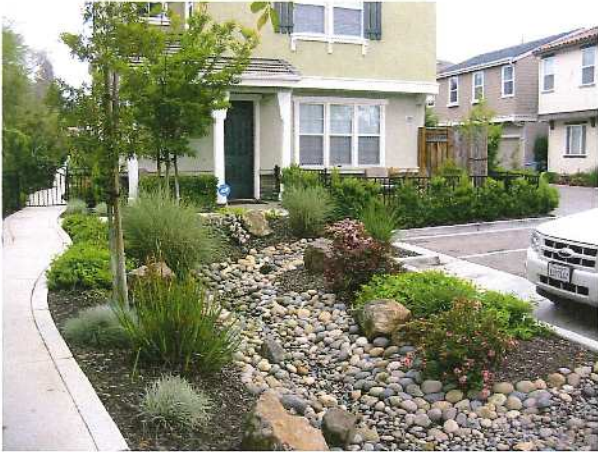
PD06-058 – Kentfield Homes