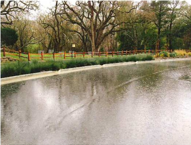
PD10-024 - Brookside Estates (Public Streets)