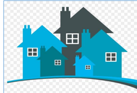
Existing Housing Units