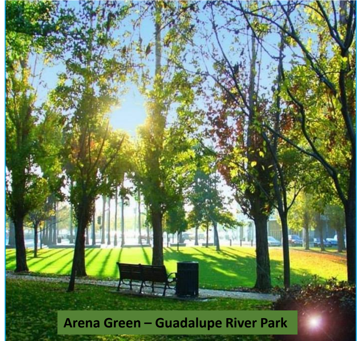
Arena Green – Guadalupe River Park