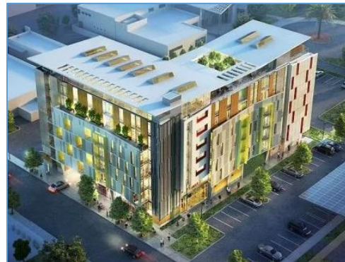
Affordable Housing (low & moderate income)