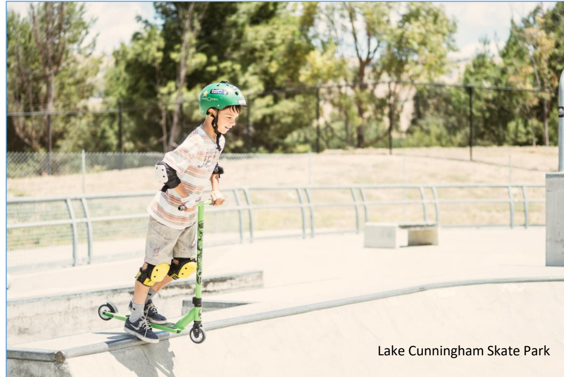
Lake Cunningham Skate Park

Inform the Neighborhoods Commission of the Parkland Developers Fee Study