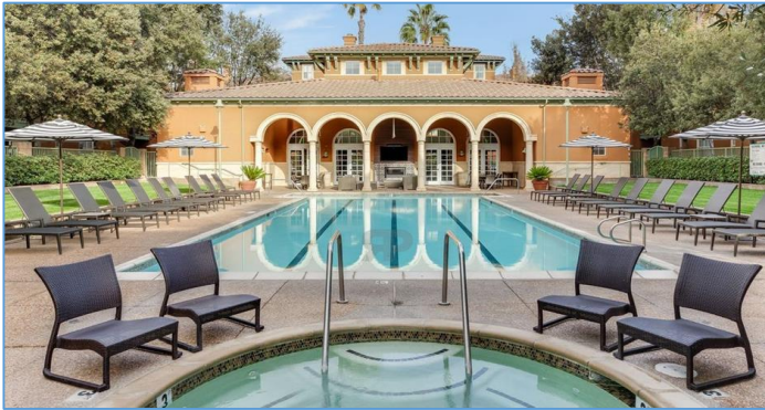
Private Recreation (on site recreational amenities)

The parkland obligation can be reduced via allowable credits: