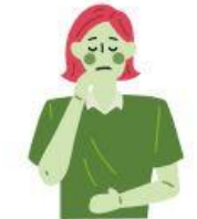
Nausea, Diarrhea, or Vomiting

DO NOT ENTER IF YOU HAVE ANY OF THE ABOVE SYMPTOMS