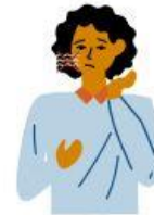
New Loss of Taste or Smell