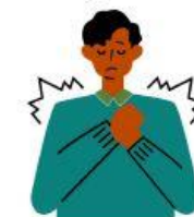
Muscle or Body Aches