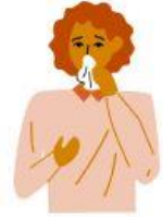
Congestion, Runny Nose or Sore Throat