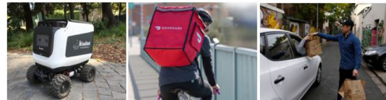
From left to right: Autonomous sidewalk delivery robots, DoorDash bike courier, UberEats delivery

Courier Network Services are on-demand delivery services where drivers deliver goods to customers who place their order via an online app or platform. Drivers typically use their own personal vehicles, bicycles, or scooters to make deliveries within a short time period. Goods that may be delivered include prepared meals, groceries, and essential household items. Customers pay for the goods and the delivery service.