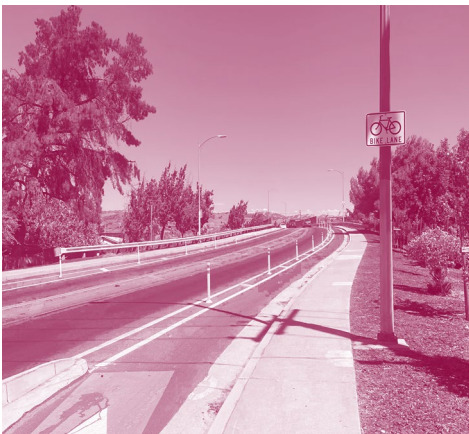
Protected Bike Lanes on E San Antonio St

For more information about this project and to view the latest designs, please visit the project page at: https://www.movesanjose.org/efforts/mclaughlin-avenue-quick-build-project/