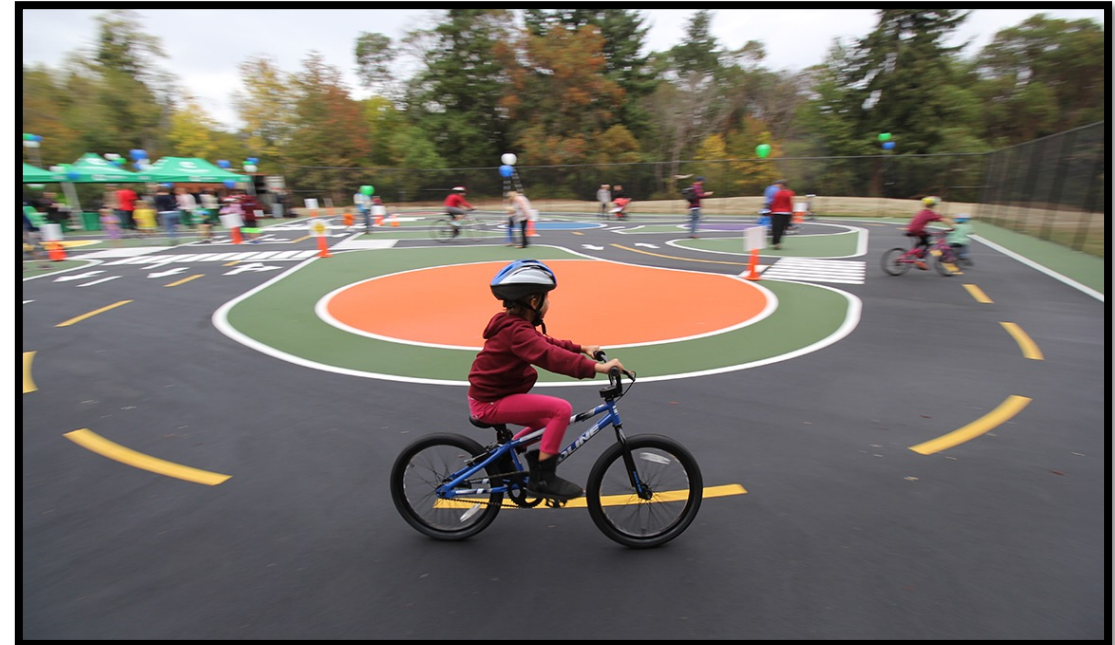
Bicycle Traffic Playground – Copenhagen