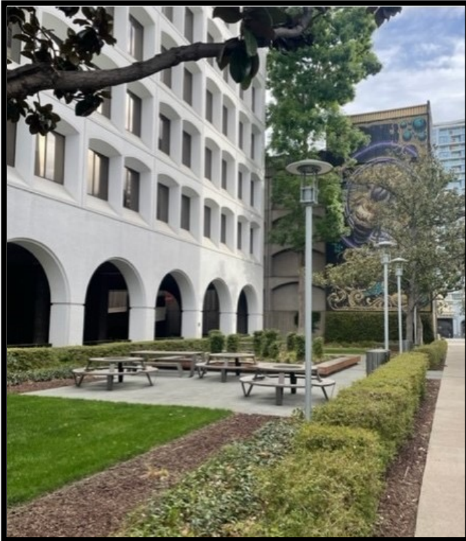
Paseo Mercurio POPOS – San Jose, CA