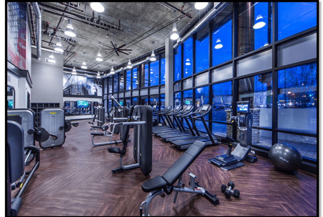
Recreation Room - Fitness Center, "The Pierce" San Jose, CA