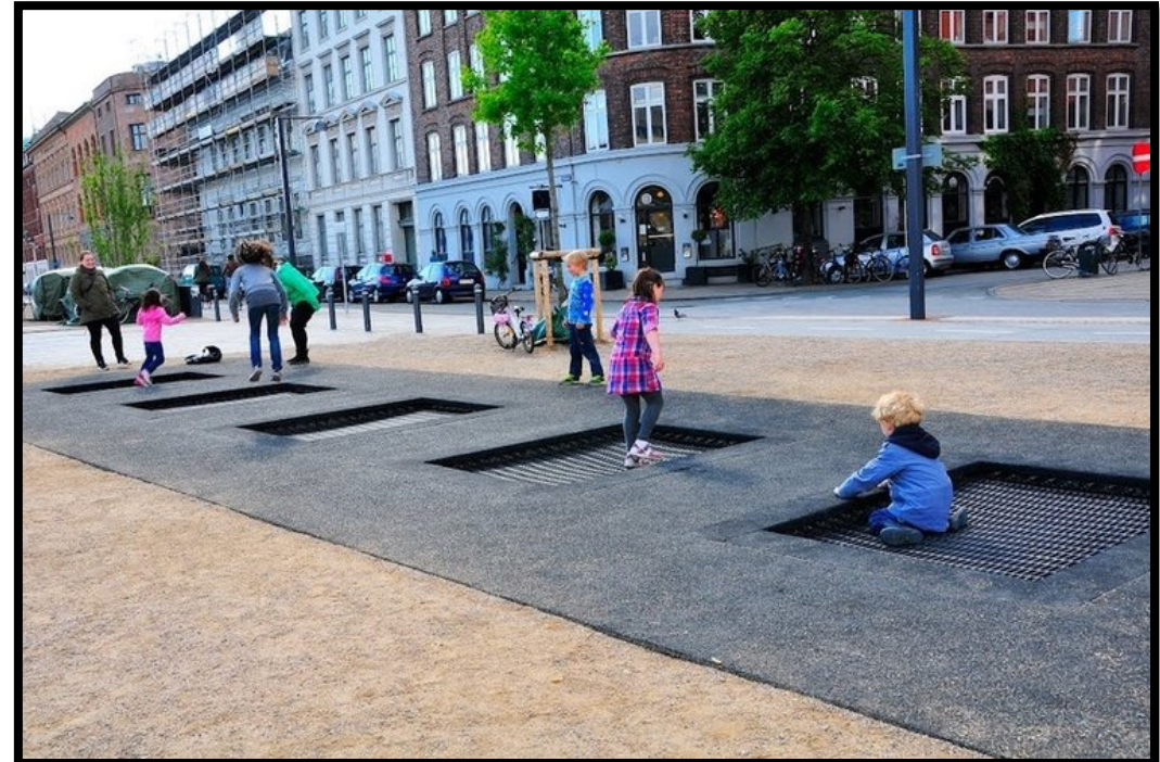
Sidewalk Trampolines – Copenhagen