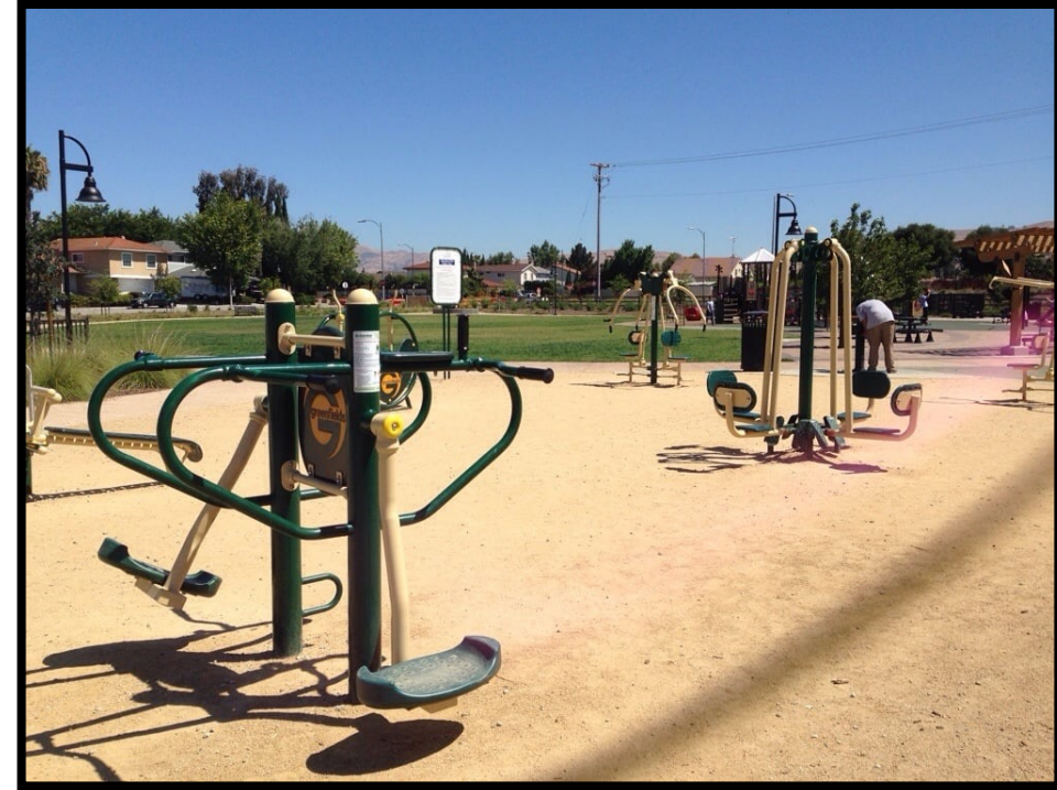
Commodore Park Fitness Equipment – San Jose, CA