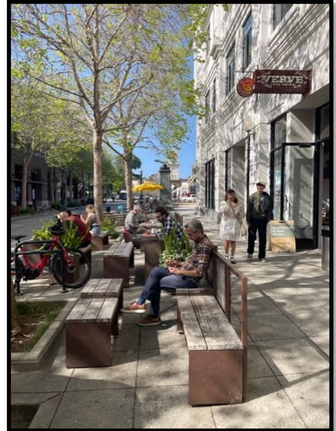
Commercial Seating POPOS – Santa Cruz, CA