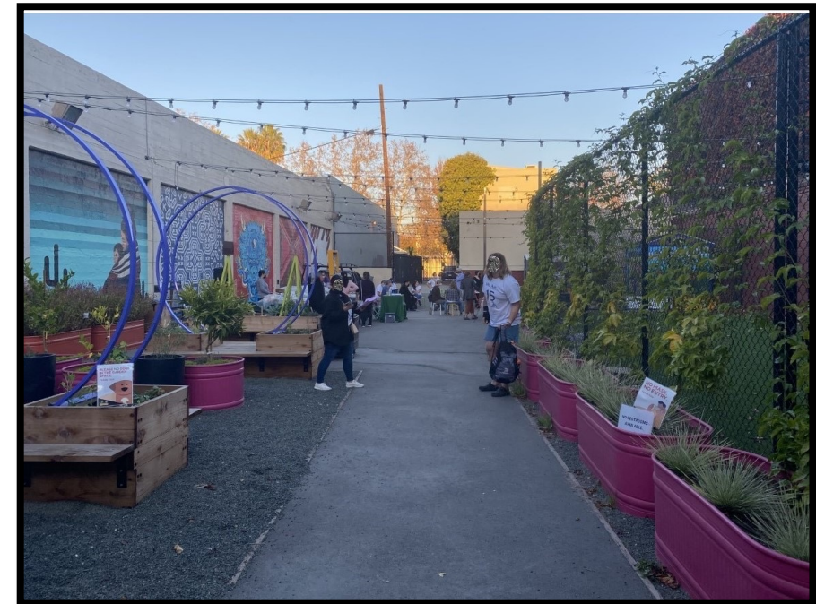
SOFA Pocket Park – San Jose, CA