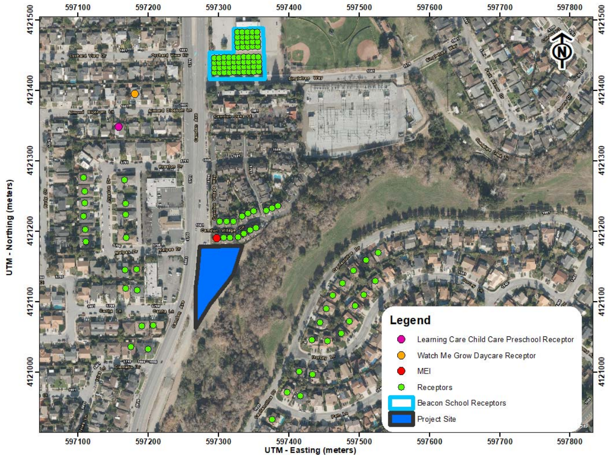
Figure 1. Locations of Project Construction Site, Off-Site Sensitive Receptors, and Maximum TAC Impact