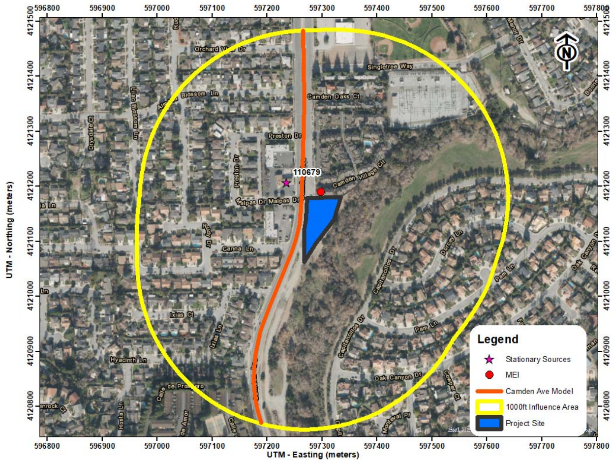
Figure 2. Project Site and Nearby TAC and PM 2.5 Sources