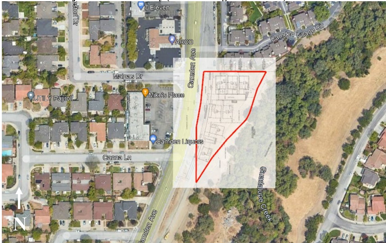
FIGURE 1 – Project Plan and Vicinity

The project site is located on an undeveloped parcel east of Camden Avenue, generally between Malpas Drive on the north and Canna Lane on the south. The project proposes to construct seven single-family homes that are connected to communal driveways. In total, the seven homes would comprise 17,210 square feet (sf) with an additional 2,982-sf allocated to the driveways. Figure 1 shows a Google Earth snapshot of the project plan and vicinity.