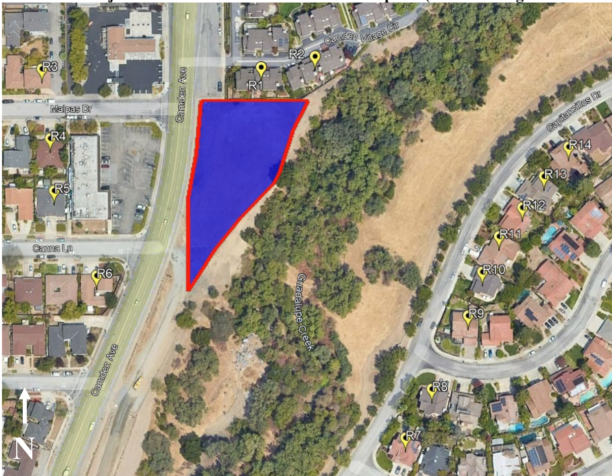
FIGURE 2 – Project site with nearest noise sensitive receptors

The construction noise levels were calculated to range from 75 to 86 dBA L_{eq} at 50 feet, using FHWA’s Roadway Construction Noise Model (RCNM), which assumes that all the equipment could be operated simultaneously. At the closest residence (R1) located about 100 feet to the north (along Camden Village Circle), hourly average noise levels are calculated to range from about 66 to 80 dBA L_{eq} (as shown in Table 6).