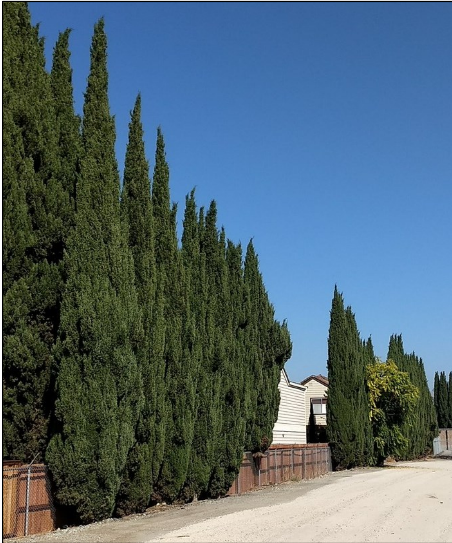
Photo 1. Row of Italian cypress ( Cupressus sempervirens ) along the northern site boundary. Tree #3557 is in the foreground.