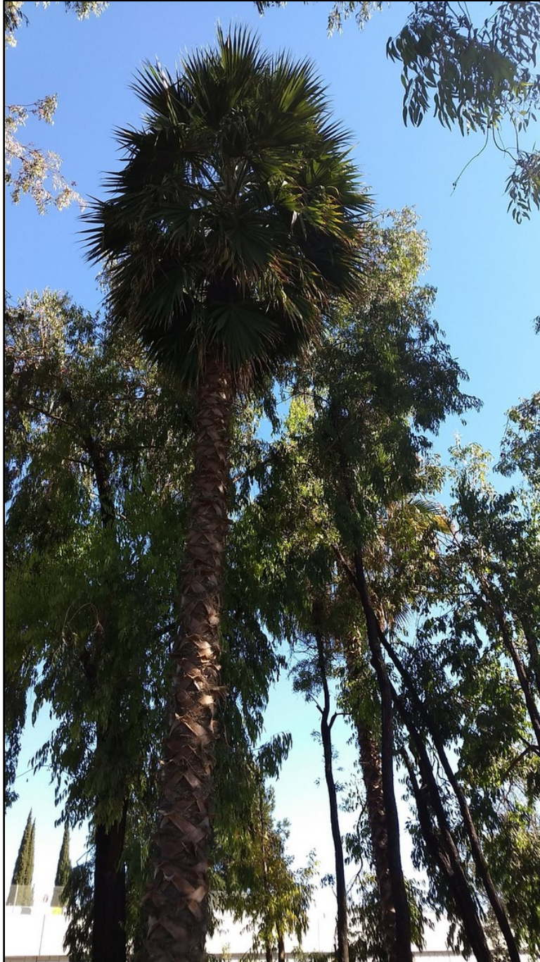
Photo 2. Tree #3221, Mexican fan palm ( Washingtonia robusta ), in a stand of red ironbark ( Eucalyptus sideroxylon ).