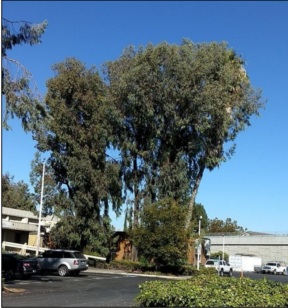
Photo 3. A stand of red ironbarks with an individual Mexican fan palm at right and Chinese hackberry ( Celtis sinensis ) in foreground (trees #3588–3592).