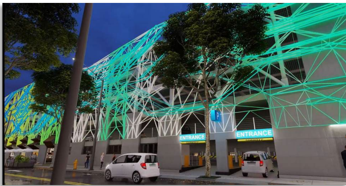
Conceptual Market Street Garage Façade Project

As parking operations are still slow in returning to pre-pandemic levels, this 2023-2027 Adopted CIP continues to focus its growing – but still limited – resources to addressing larger scale maintenance needs and rehabilitating the aging garage elevator infrastructure system-wide.