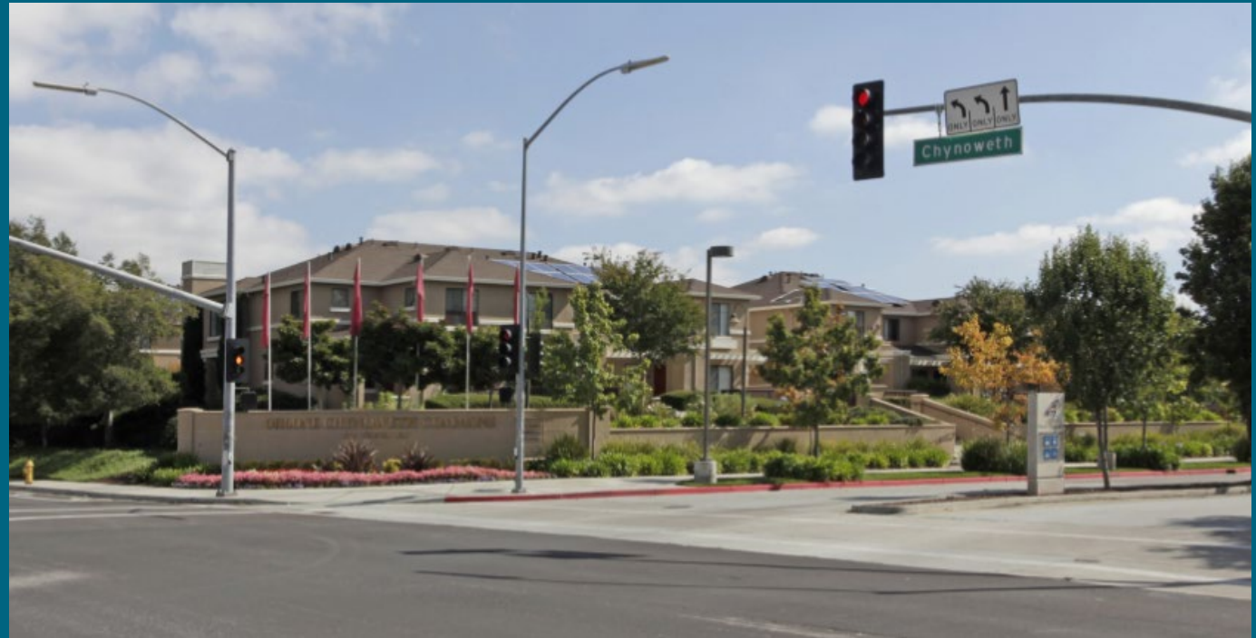
Ohlone Chynoweth – Affordable housing development located on a Light Rail Station