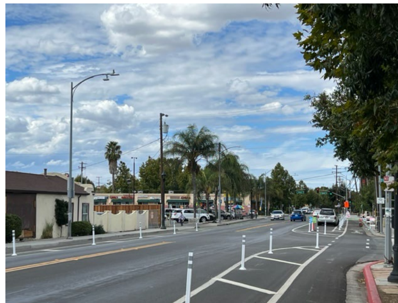
4 - Protected bike lanes on McLaughlin Ave

Phase 1 of the project will also include transit boarding islands. Transit boarding islands provide a dedicated space for transit riders to wait for the bus while not blocking the sidewalk. They also reduce conflicts between buses and bikes and improve transit reliability. Construction of the transit boarding islands will begin fall of 2023. Until then, we have relocated the northbound bus stop from Sunny Ct to the north side of the William Ct intersection.