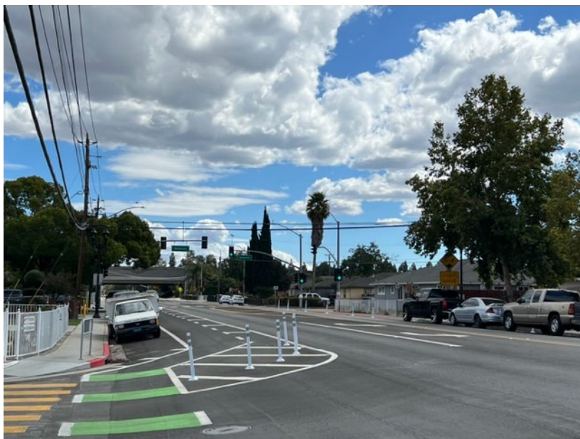
3 - Buffered and protected bike lanes on McLaughlin Ave

Earlier this week, City crews completed the first part of the McLaughlin Avenue Complete Streets Project . This project aims to make McLaughlin safer and more inviting for all travelers. The first part of this project was implemented through the City's annual pavement maintenance program. The recent installation included new protected bike lanes with plastics posts to separate the bike lanes from automobiles.