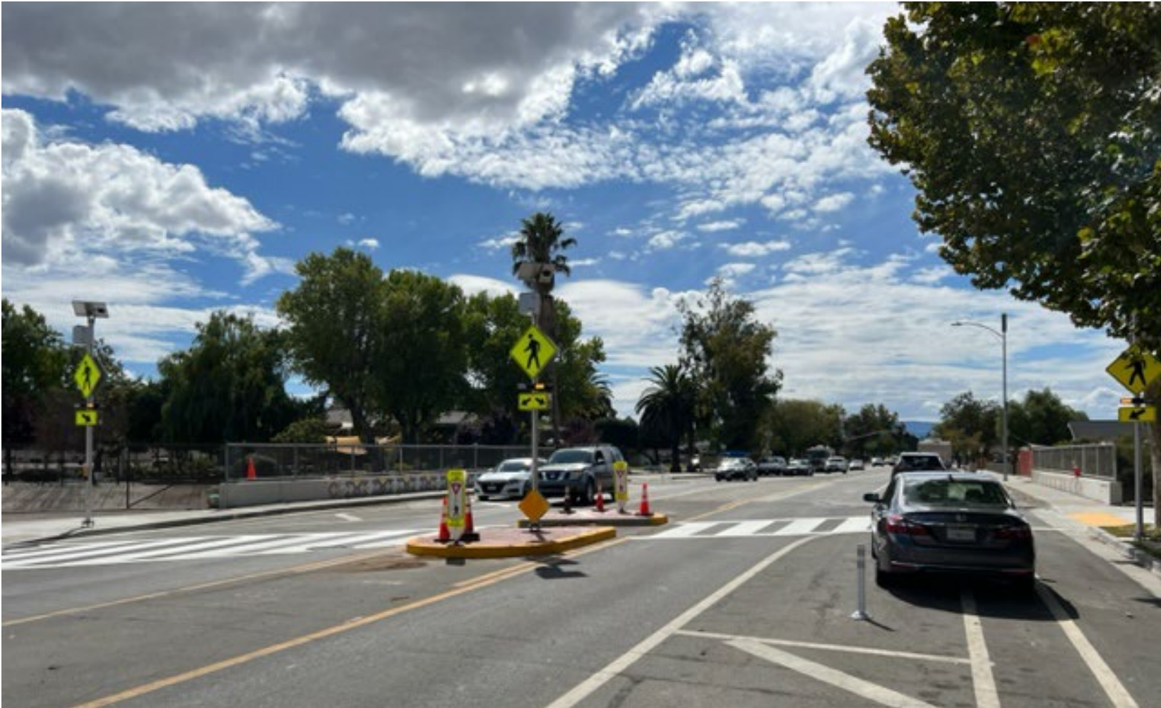
2 - New crossing with rapid flashing beacons at San Antonio St and Lower Silver Creek