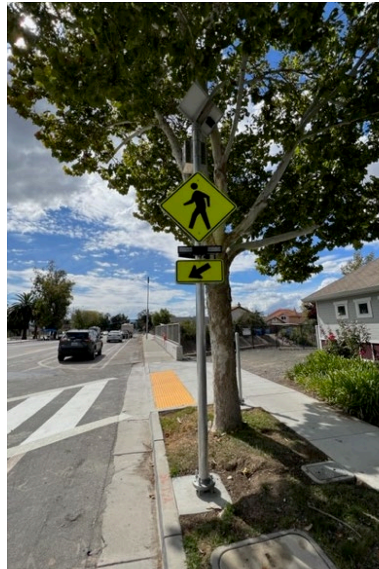
1 - Rapid flashing beacon at the new crossing on San Antonio

This month, city crews completed installation of a new crossing near Our Lady of Guadalupe Church and Lower Silver Creek. This crosswalk was originally envisioned in the En Movimiento plan. The city prioritized construction of this crossing due to community input. An extended permitting process delayed the construction of this project initially, but we are happy to see it finished.