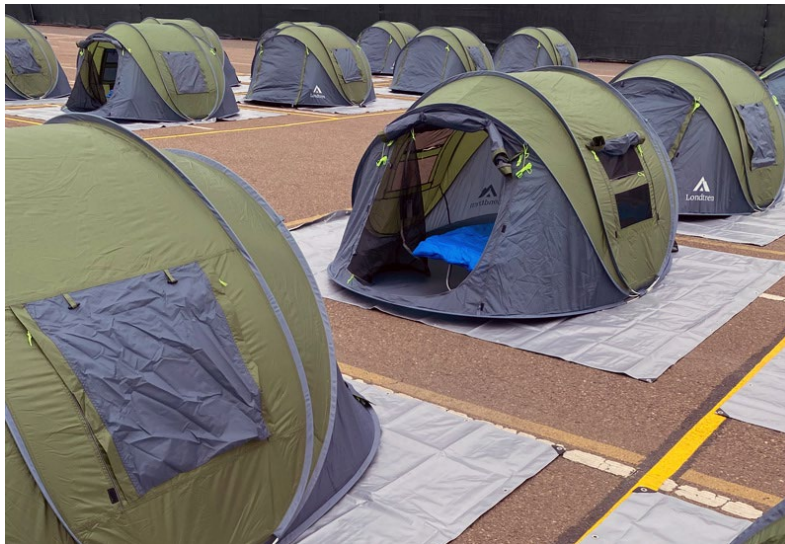
Safe sleeping site in San Diego

The City Manager is directed to identify one-time and ongoing funding to bring basic, low-cost, low-barrier safe sleeping sites online by the end of December 2024 — conditioned upon the Council approving one or more sites before July 2024 — with enough capacity to significantly reduce the number of unmanaged encampments along our waterways. Furthermore, and aligned with the MBA proposed by Councilmembers Doan and Batra on low-barrier solutions to homelessness, the City Manager should include a broader evaluation of low-cost strategies and potential sites — including Valley Water sites — with the goal of moving people out of our waterways over time while preventing homeless residents from being displaced into other neighborhoods. When evaluating congregate shelter opportunities, specific attention should be allotted to models that prioritize the physical and mental well-being of residents.