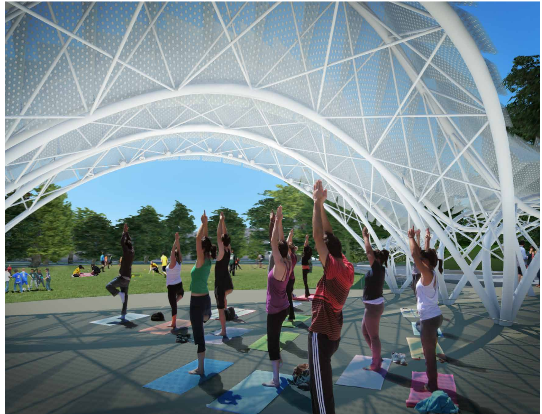
The pavilion, during daytime, is a social and recreational hub for a range of activities.