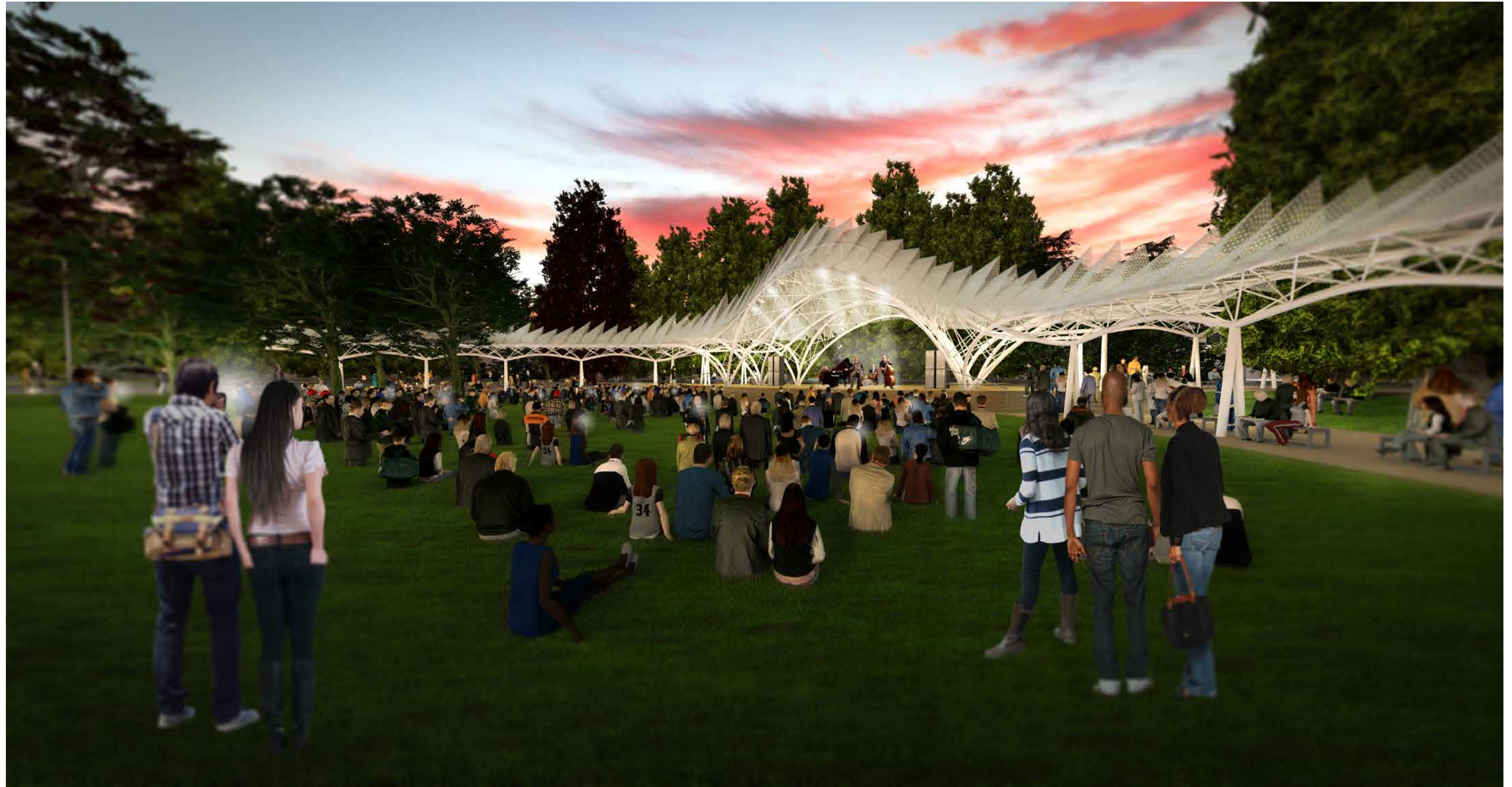
The Levitt Pavilion San Jose: a cutting-edge concert venue and dramatic urban backdrop