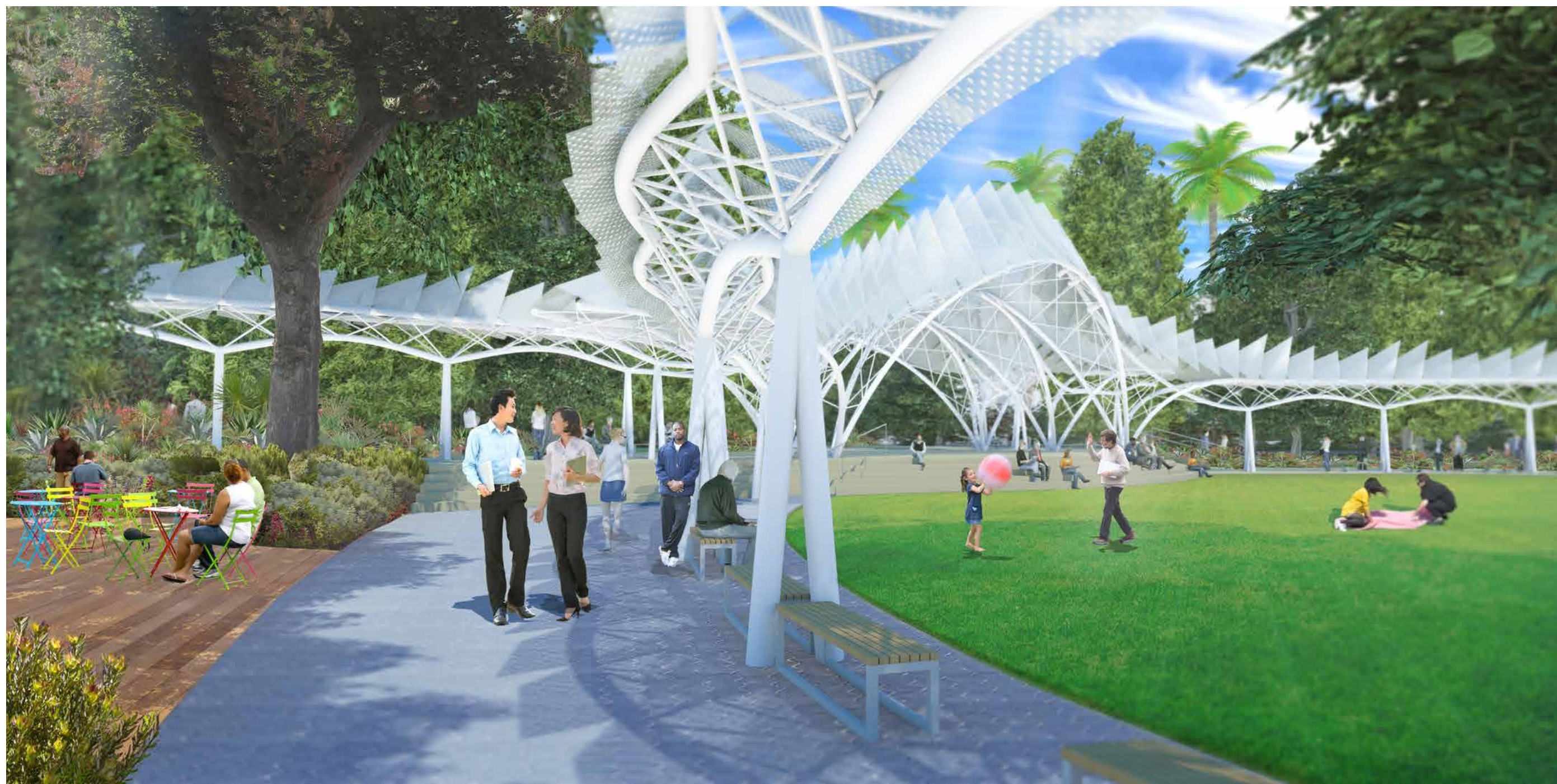
Pavilion Colonnade: shade canopies wrap around The Lawn adjacent to the cafe.