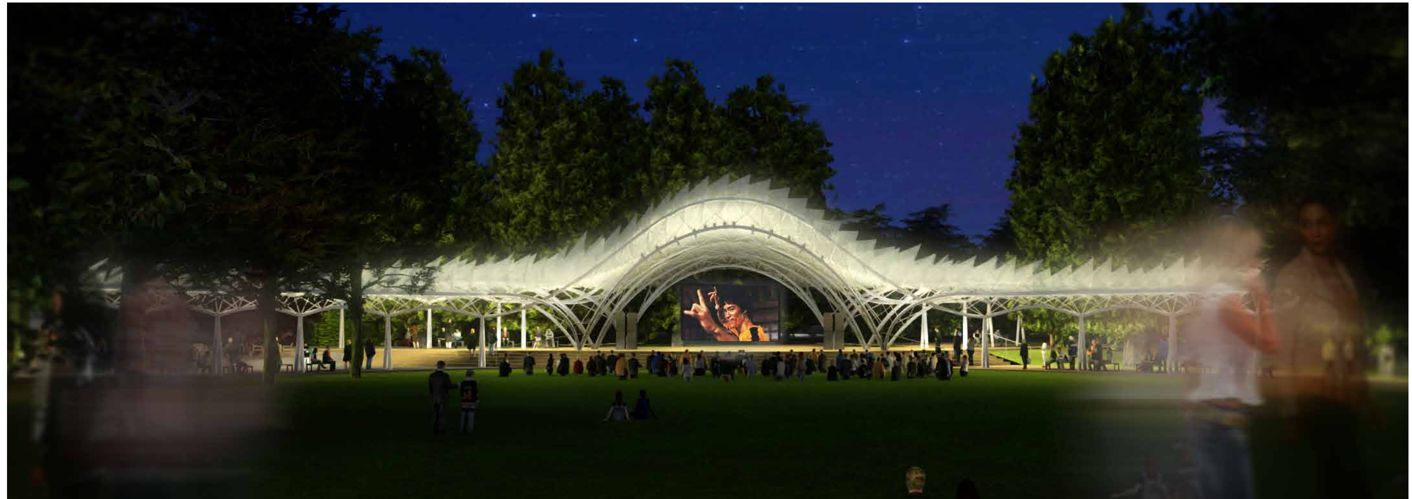
The Pavilion fits seamlessly into the new St. James Park network of pathways and lawns.

The pavilion has dramatic lighting and a cutting-edge focused sound system that transforms the space into a performance venue of the highest quality. The stage and surrounding canopy arms each house fixed sound and lighting elements that facilitate a rapid and scalable setup for a range of activities, from solo acoustic sets to more complex musical ensembles. The generous open stage will accommodate many performance types from operas, symphonies, and large bands to solo musicians. The Lawn creates a flexible space for visitors to spread out a blanket and sit directly in front of the performers to enjoy the show or stroll along the edges under the canopy wings. The Lawn readily accommodates audiences of 5000 people.