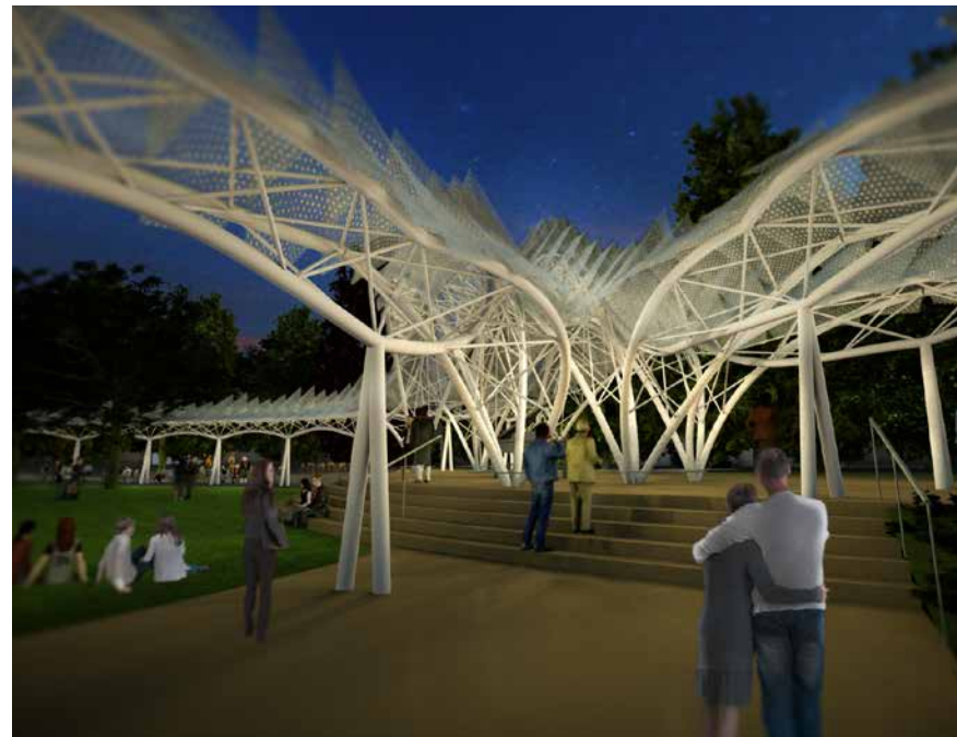
Sinuous illuminated colonnades are designed to encourage visitors to meander and relax in the evening.

First and foremost the Levitt Pavilion will be a welcoming place of leisure and recreation for the neighborhood to enjoy. During the day, the pavilion creates a neighborhood place - a cool shaded colonnade for strolling, an open urban stage for casual gatherings, a generous lawn for Frisbee, seating for neighbors to meet and chat. In the evening, the pavilion is a striking illuminated feature and a place to host a neighborhood event or barbecue, enjoy a coffee with a friend. It performs more like a hub with shade canopies and can support programs that make it an attractive place to walk through and visit during the week and on weekends; a safe, meeting place for the neighborhood. The central pavilion also provides flexible open space that accommodates multiple informal programs like yoga, exercise meetups, dance recitals, poetry readings, and small ceremonies.