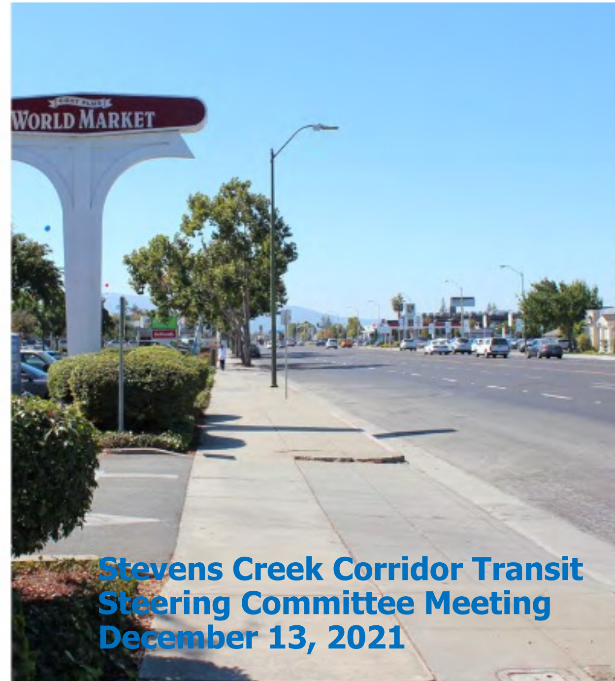
Stevens Creek Corridor Transit Steering Committee Meeting December 13, 2021