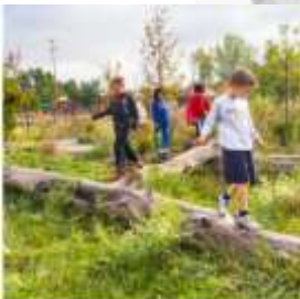
Natural Play Areas