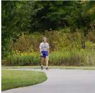
Fitness Walk with Signage / Markers for Entire Park