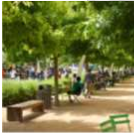
Picnic Areas with Shade