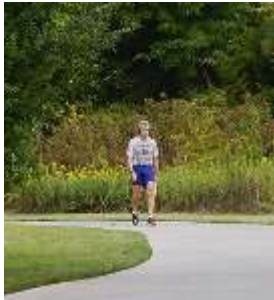
Fitness Walk with Signage / Markers for Entire Park