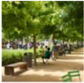
Picnic Areas with Shade