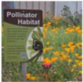
Pollinator / Perennial Gardens