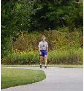
Fitness Walk with Signage / Markers for Entire Park

Concrete walks to match existing + seating