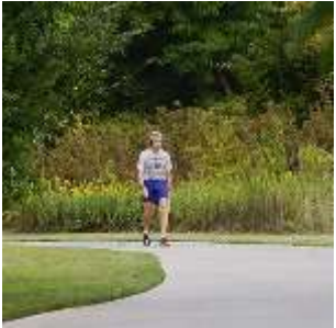
Fitness Walk with Signage / Markers for Entire Park