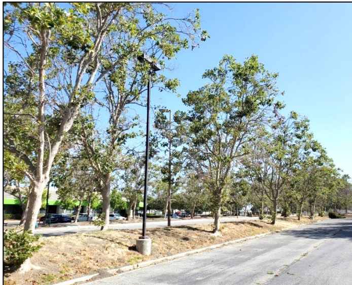
Photo 2. London planes grew in two alternating rows along Baypointe Avenue (in background). View is from the south.

Twenty-eight (28) London planes were growing on a dry berm along Baypointe Parkway (24% of the population, Photo 2). Almost all (26) trees were in fair condition with codominant stems or multiple attachments. Plane #116 was in poor condition and crowded by a nearby ash; #120 was dead. Crowns were sparse and trees appeared drought stressed. Trunk diameters ranged from 9 to 14 in.